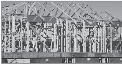
building under construction

When I think about basic rights to food, shelter, water and fuel I feel like a . . .